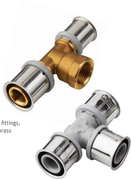
Press fittings, DZR brass